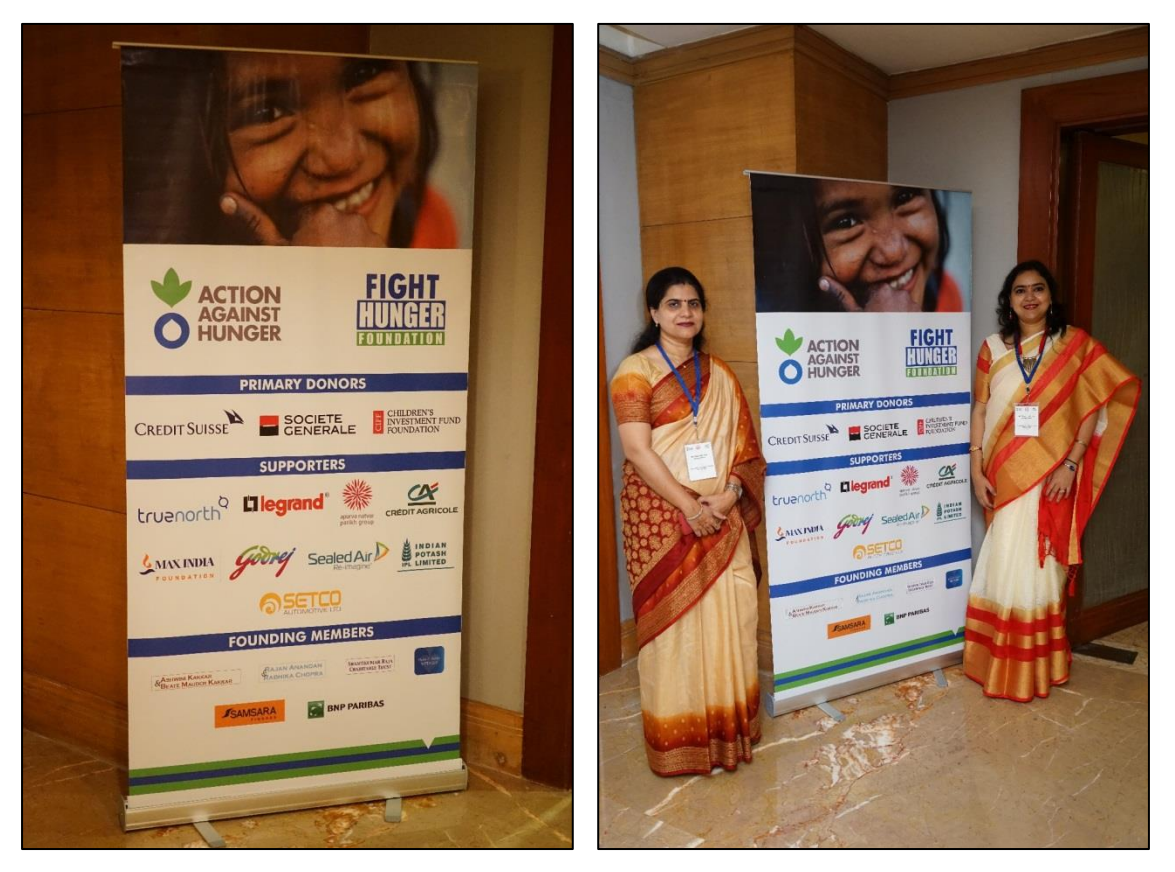
Branding Visibility of IPL during our Stakeholder workshop in Mumbai Oct 2017

From Left, RUTF safely stored at SHC and on right, community worker on field demonstrating use of Filter cloth provided in WASH basket during Poshan Day's